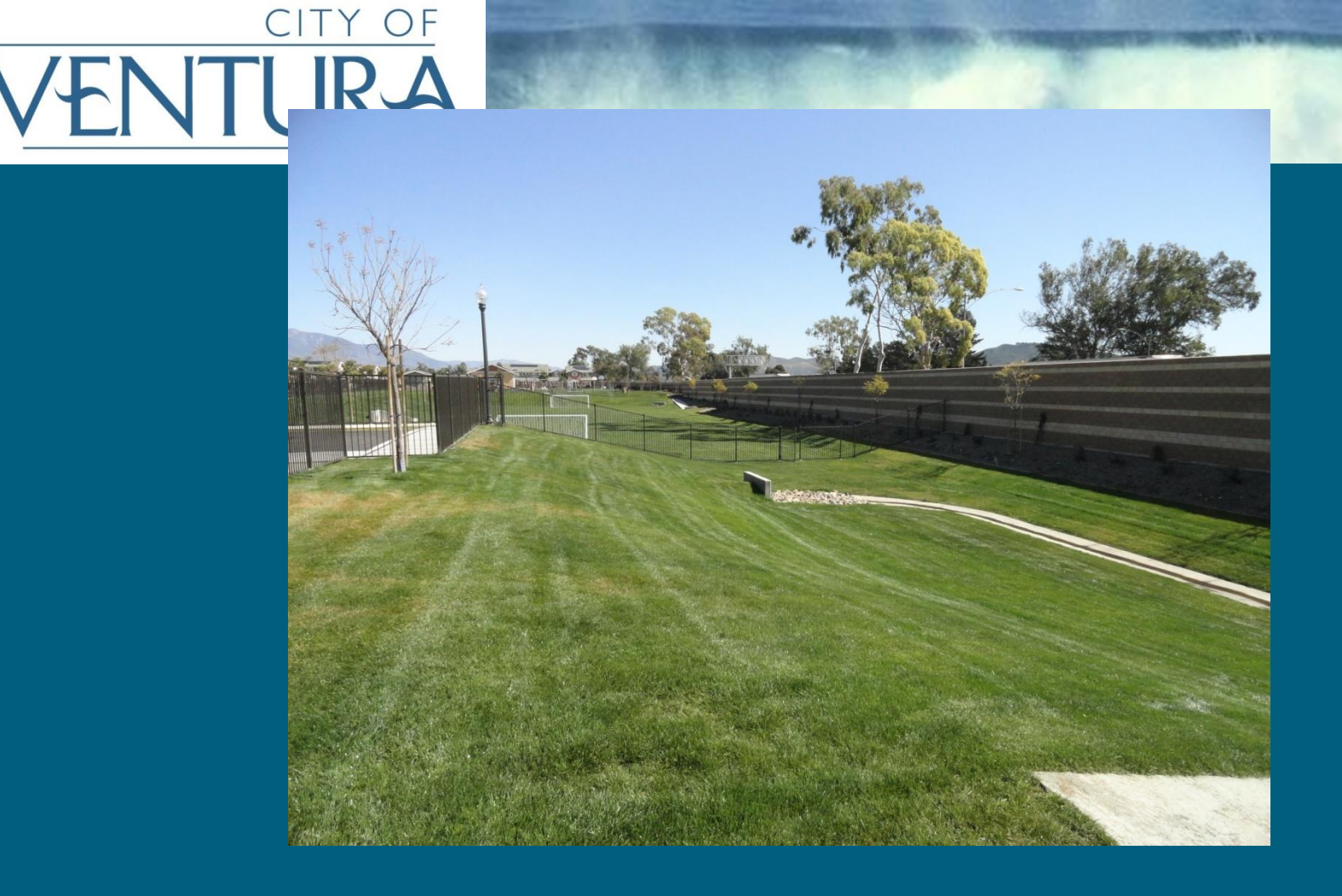
Park and Detention basin