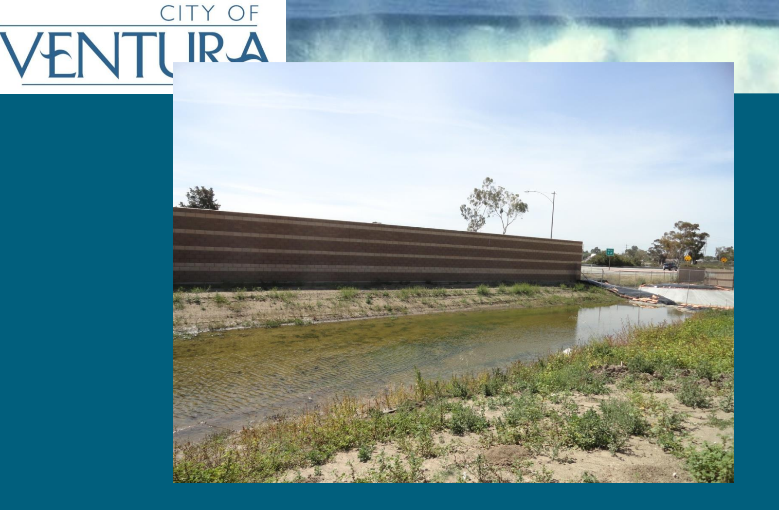
Construction phase of detention basin