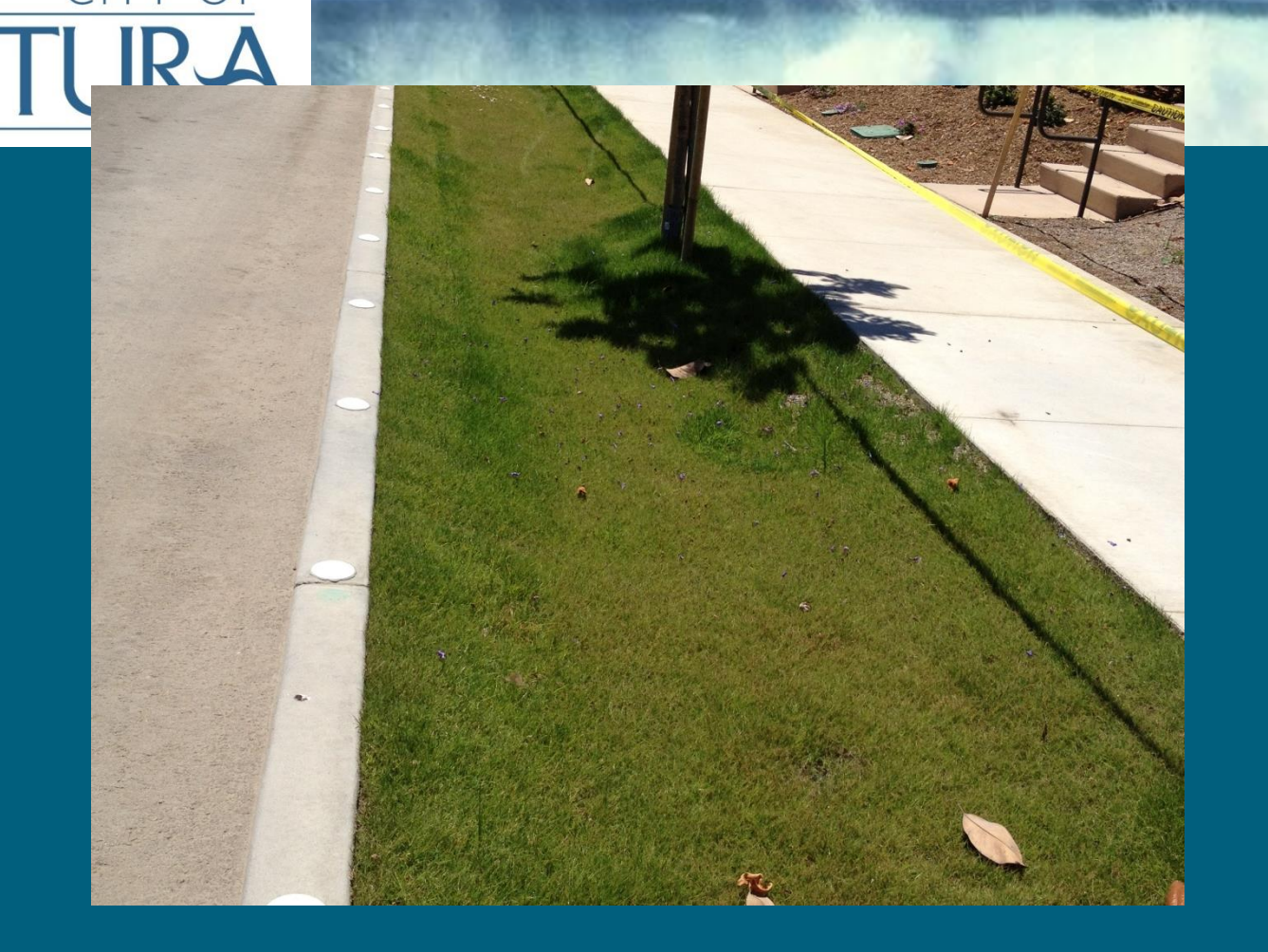
LID Parkway swale with zero curbs