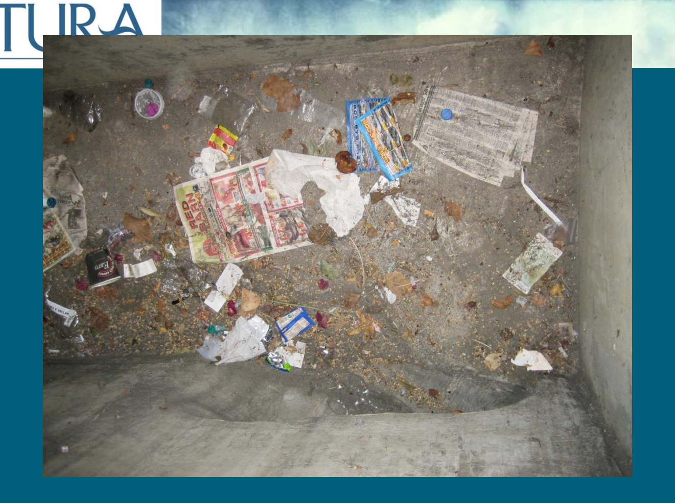
High Trash Catch Basin

Drop catch basin before trash excluder installation